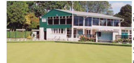
Fendalton Bowling Club

Sited in the south eastern corner of the picturesque Fendalton Park, the three green complex has excellent clubhouse facilities as well as highly rated 36.6m x 36.6m cotula-maniototo weed greens. Amalgamated as one club in 2004 this progressive club has 270 members.