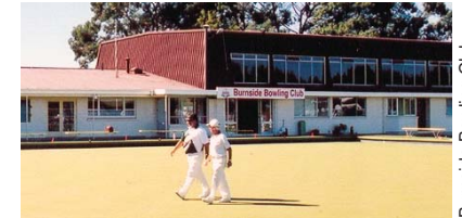
Burnside Bowling Club

With over 300 members and a three green complex, Burnside BC is the largest bowling club in the South Island and is ideally placed to be the headquarters club for the Asia Pacific Bowls Championship 2007 and the World Bowls Championships 2008. The 36.6m x 36.6m cotula-maniototo weed greens are bordered by prize winning gardens with a central, welcoming clubhouse. The club is located in Burnside Park in the Christchurch suburb of Avonhead.