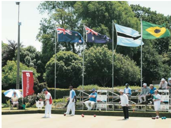
Play at the 3rd World Singles held at Fendalton in November 2005

The champion singles players (male and female) from over 30 countries compete for the coveted title of World Singles Champion of Champions. In an exciting, spectator-friendly format each game consists of two sets of nine ends with, if necessary, a three end tie breaker.