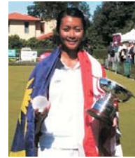
Nor Inyani Azmi (Malaysia) World Singles Champion 2005

Teams of five in premier men and premier women, under 25 men and development squad women vie for Trans Tasman supremacy and bragging rights. These two three-day tests provide ideal preparation for two of the heavy weights of world bowls for the World Championships.